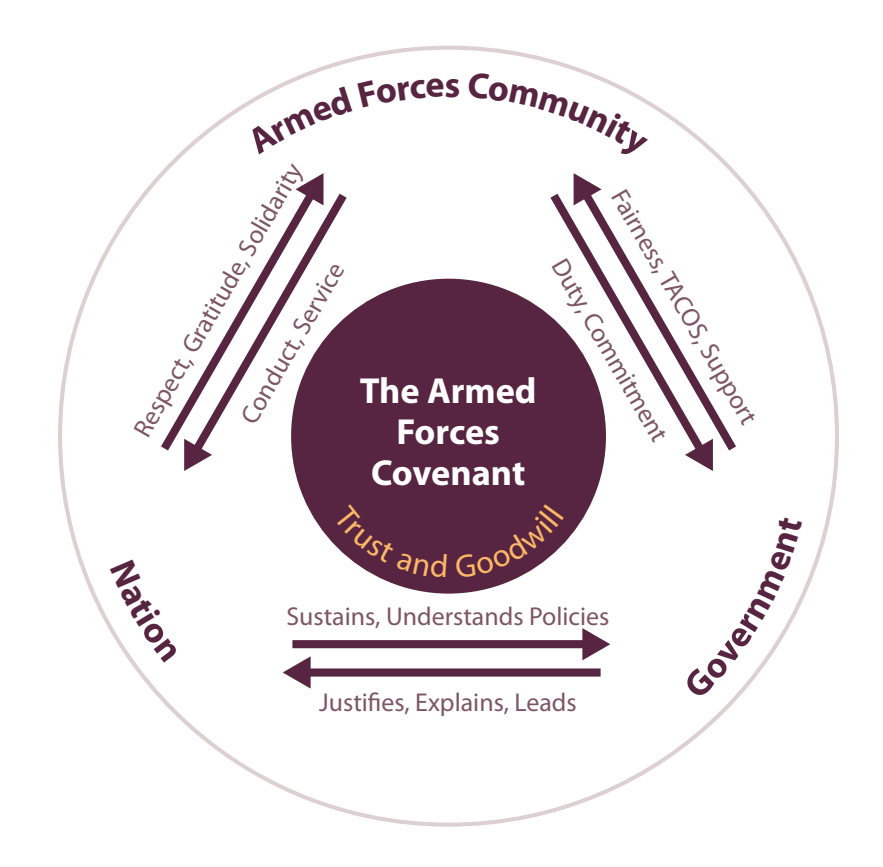
Figure 4: Obligations

These obligations do not require detailed explanation, but it is possible to derive from them a number of additional principles, which should similarly govern the actions of the Nation, the Government and the Armed Forces Community.