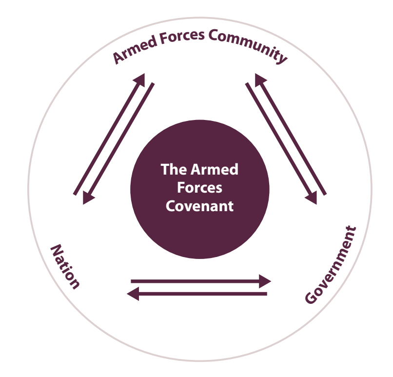
Figure 1: The Covenant Diagram

This document accompanies the Armed Forces Covenant and provides guidance on how it is to be put into effect, by describing: